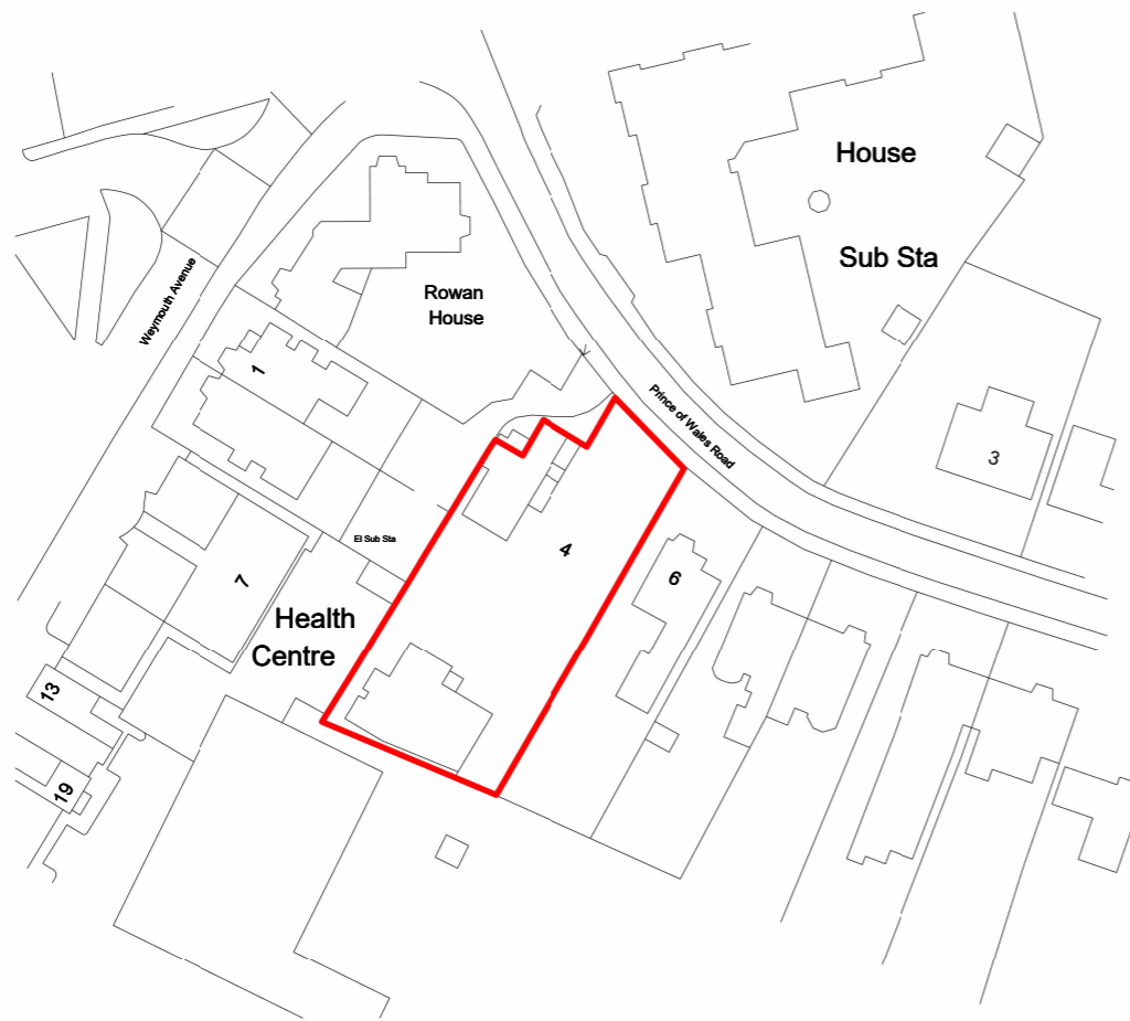
EXISTING Site Location Plan Scale 1 : 1250 @A3