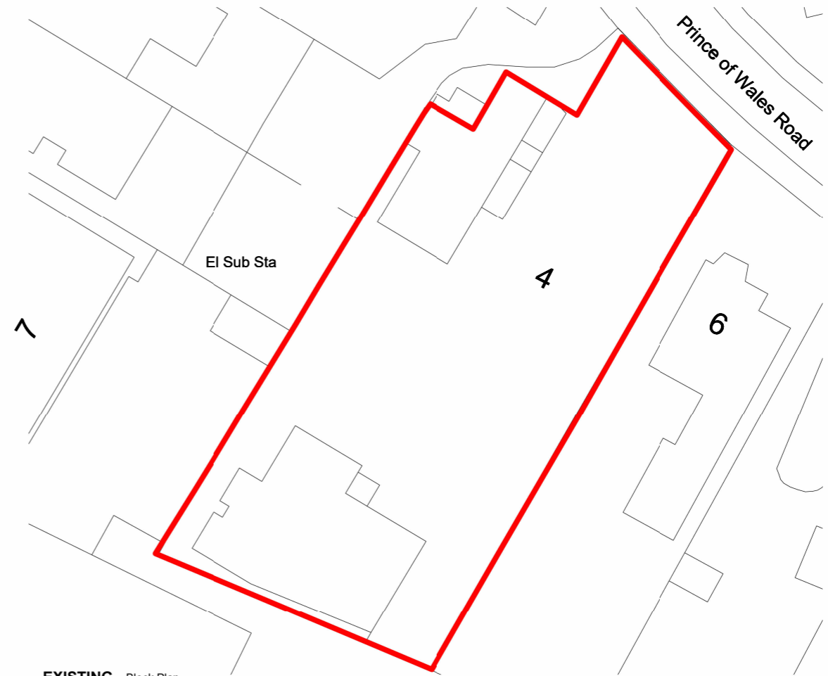
EXISTING Block Plan Scale 1 : 500 @A3